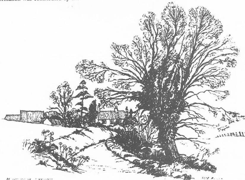
High House, Parham

This exercise has proved most successful, resulting in a Suggested Action Plan being produced, which will be presented to the Parish Council and the community for consideration.